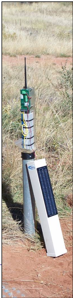
FGRCP LineMarker Test Station