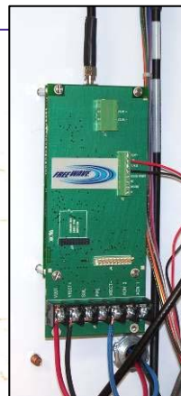
FGRCP Board Level Radio