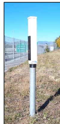
Model FGRCP LineMarker Test Station on 3 inch conduit pipe.